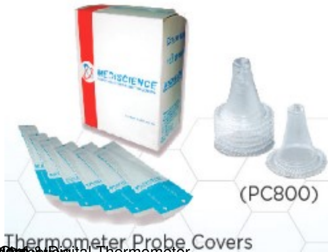
Packaging of the PC800 for Digital Thermometer.