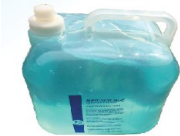
Ultrasound Gel (5 liter)

Basic ingredients (5 liters): Sodium Carboxymethylcellulose, EDTA, Sodium Methyl Parabens, Sodium Propyl