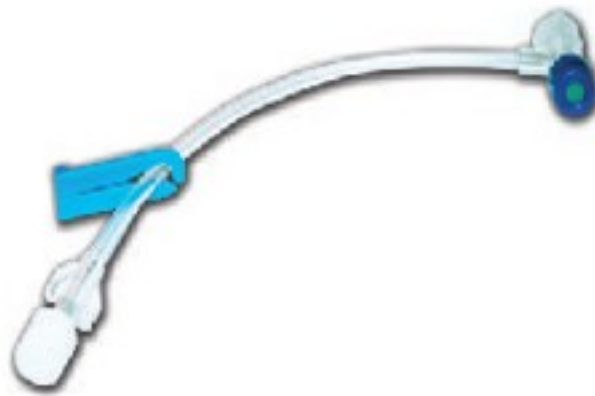
Design of the Extension with Slide Clamp