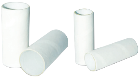
Mouth Piece Peak Flowmeter

Brand : Mediscience Registered Under Act 737 MDA: GA2193822-92540