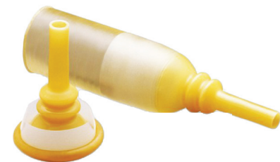
Male External Catheter

Brand : Mediscience Registered Under Act 737 MDA: GA6169721-71074