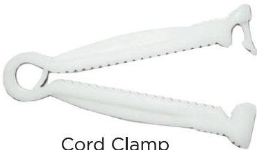
Cord Clamp Brand : Mediscience Registered Under Act 737 MDA: GA2393022-87007