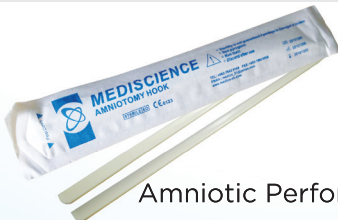
Amniotic Perforator Brand : Mediscience Registered Under Act 737 MDA: GA367581364719