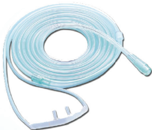
Nasal Cannula adult, child & Neonate