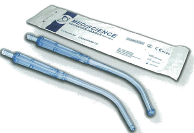
Yankauer Sucker with Vent

Brand : Mediscience Registered Under Act 737 MDA: GA5599721-68352