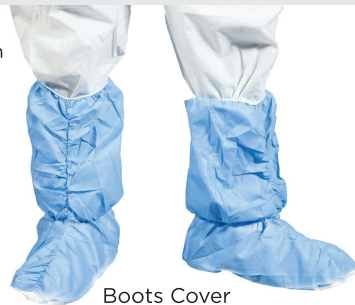
Boots Cover Knee Length

Brand : Mediscience Registered Under Act 737 MDA: GA7503120-38269