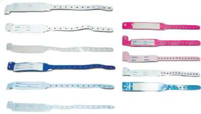
ID Bracelet (write on / insert card)

Brand : Mediscience NOT A MEDICAL DEVICE