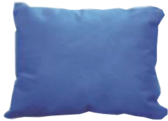
30gsm / Blue Pillow Case + PE Coating

Brand : Mediscience Registered Under Act 737 MDA: GA10381220-41321