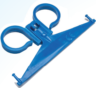
Urine Bag Hanger

Urine Bag Hanger, Male External Catheter, Yankauer Suction