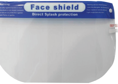
Anti Fog Face Shield