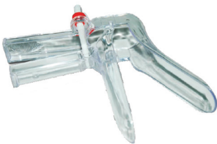
Vaginal Speculum Brand : Mediscience Registered Under Act 737 MDA: GA7605822-90779